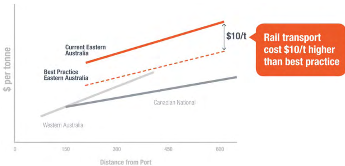
Table 1. Inefficiency of eastern Australia grain on rail price (red line) vs Canada (dark grey line)

Mainline, intercontinental or 'Class-1' rail operations are a decisive profitability driver of North American grain supply chains, whereas by contrast, Australia's lack of an effective equivalent freight mainline is, especially on the east coast of Australia, leading the grains sector to less than productive, road, branch line rail and port competition and efficiency outcomes. Recent Graincorp analysis comparing the Canadian and Australia's east coast grain freight rail systems reveals that at representative distances from port, New South Wales grain costs over $20 per tonne more to move than its Canadian equivalent ii .