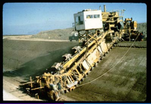
Paving The Aqueduct