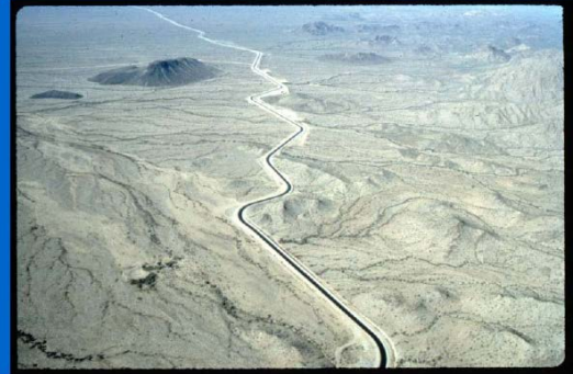
Water Moves By Gravity